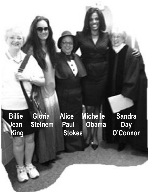
Billie Jean King Gloria Steinem Alice Paul Michelle Obama Sandra Day O'Connor

No meetings will be held until September when The Outlanders will be discussed.