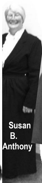
Susan B. Anthony